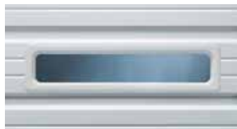
24" X 6" DSB or INSULATED GLASS