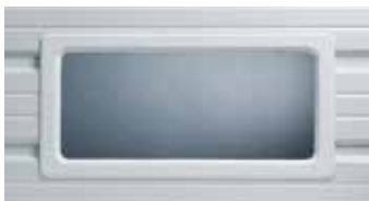
24" X 12" DSB or INSULATED GLASS