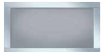
OPTIONAL FULL-VIEW PANEL