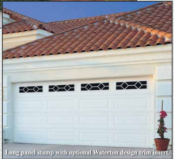
Long panel stamp with optional Waterton design trim insert.