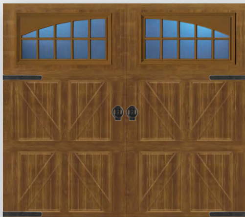
Nottingham Handles & Hinges