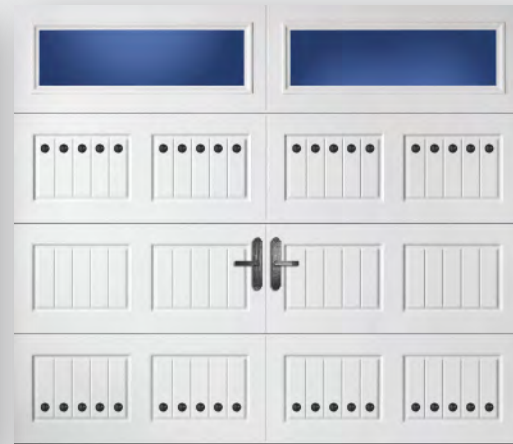
Maple Creek Handles & Clavos