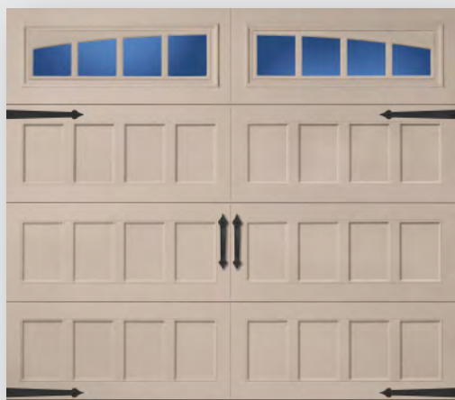
Castle Rock Handles & Hinges